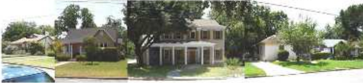
Proposed New Construction