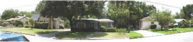
Existing Home Front Elevation