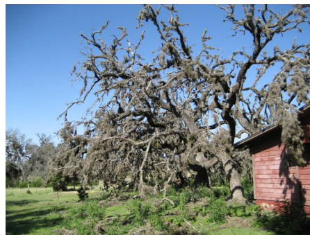
LIVE OAK OAK WILT

If you see damage on a Oak tree in the public right away contact the City at 210-822-3331 so preventive measures can be taken.