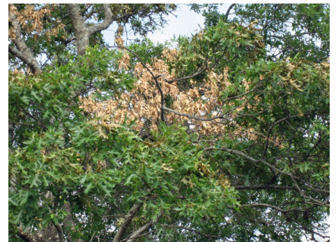
RED OAK OAK WILT