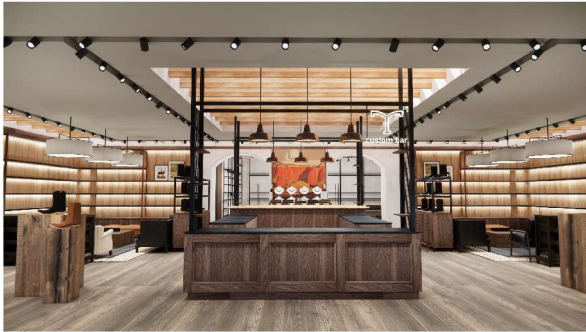
1 ENTRY RENDERING 1/4" = 1'-0"

ARCHITECT: O WILLIAM THUNDER GRAY TEXAS REG NUMBER: 16119 EXPIRATION: 10/31/2024