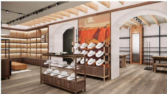
5 HATS RENDERING 1/4" = 1'-0"