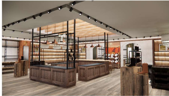
2 BAR RENDERING 1/4" = 1'-0"