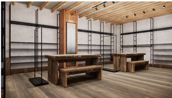
3 APPAREL RENDERING 1/4" = 1'-0"