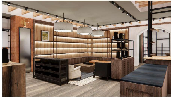
6 BOOT LOUNGE RENDERING 1/4" = 1'-0"