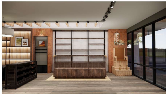
4 ACCESSORIES RENDERING 1/4" = 1'-0"