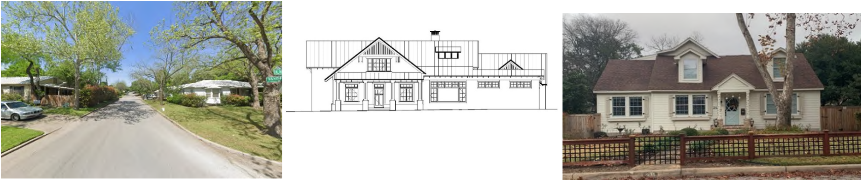
PROPOSED STREETScape PANORAMA