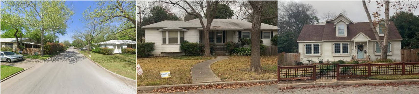
EXISTING STREETScape PANORAMA