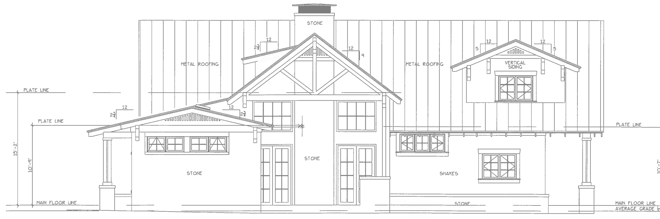
EAST ELEVATION - MAIN STRUCTURE