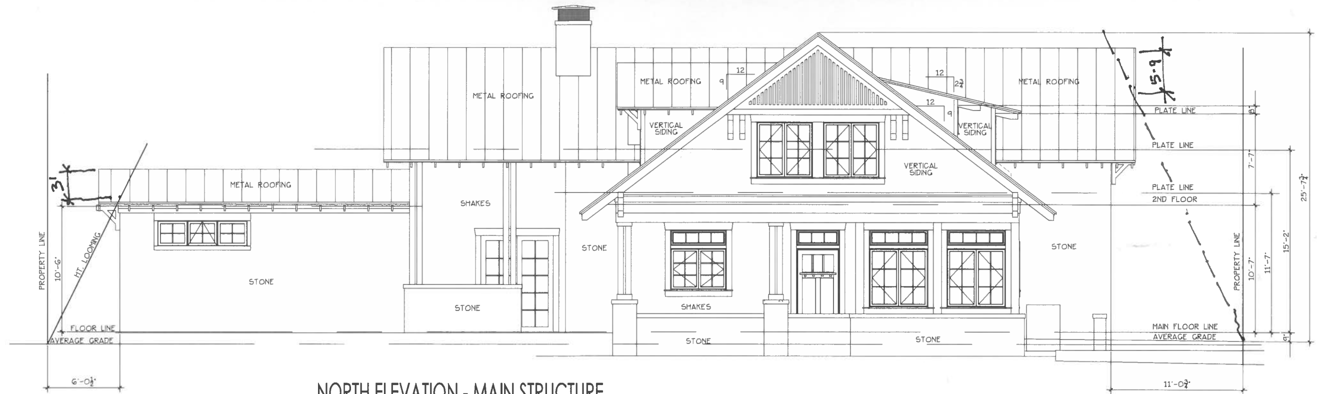
NORTH ELEVATION - MAIN STRUCTURE