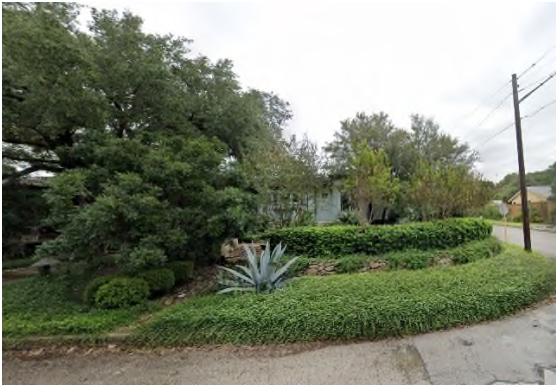
ACROSS FROM PROPOSED PROJECT