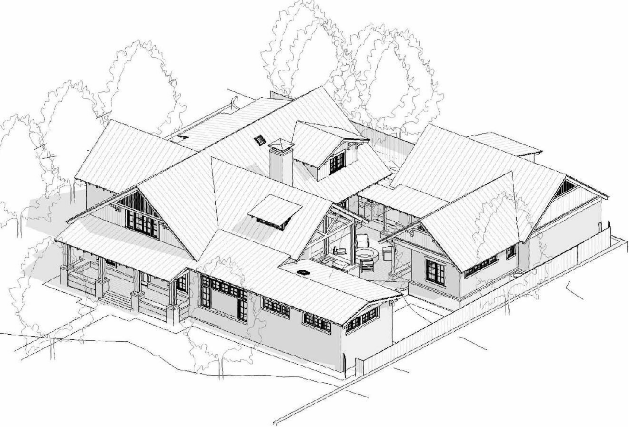
Southeast Bird's Eye View