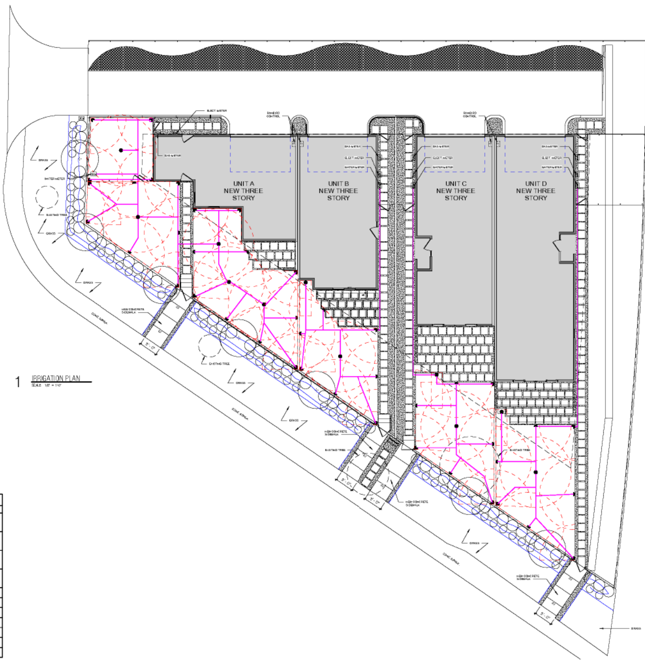
1 IRRIGATION PLAN SCALE: 1/8" = 1'-0"