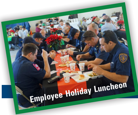
Employee Holiday Luncheon