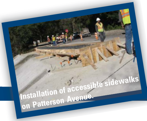
Installation of accessible sidewalks on Patterson Avenue.