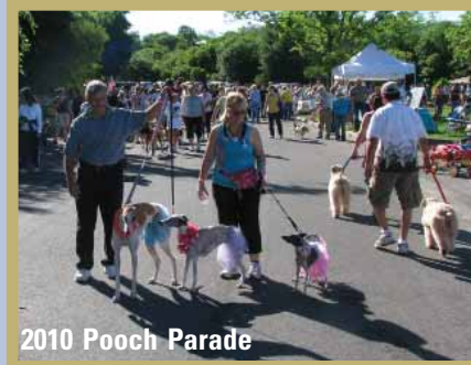
2010 Pooch Parade

Positive animal rabies cases are greater in the springtime months than other times of the year. You never know when an unvaccinated pet or wild animal exposed to the rabies virus may come to visit. Make sure to keep all pets vaccinated against rabies! City Codes requires that all dogs, cats, and ferrets are vaccinated against the rabies virus. Contact your veterinarian for more information on the rabies vaccine and other immunizations available to protect your pet.